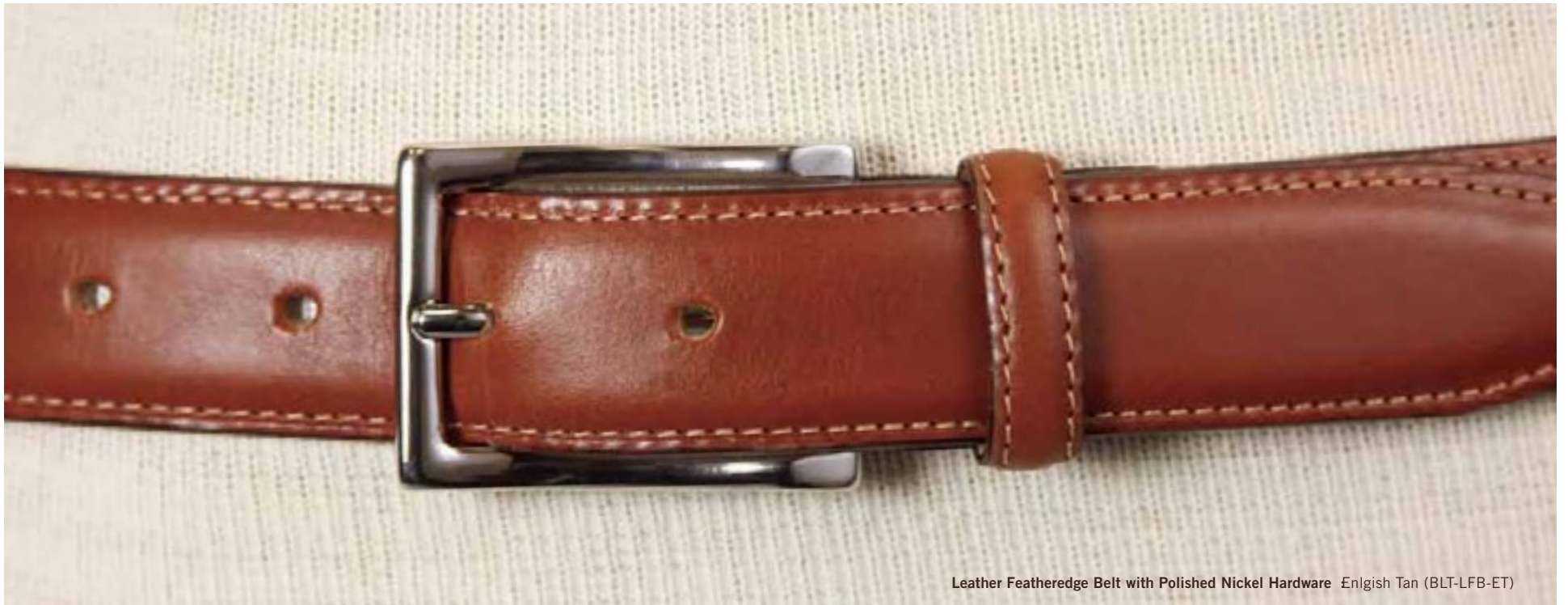
Leather Featheredge Belt with Polished Nickel Hardware English Tan (BLT-LFB-ET)