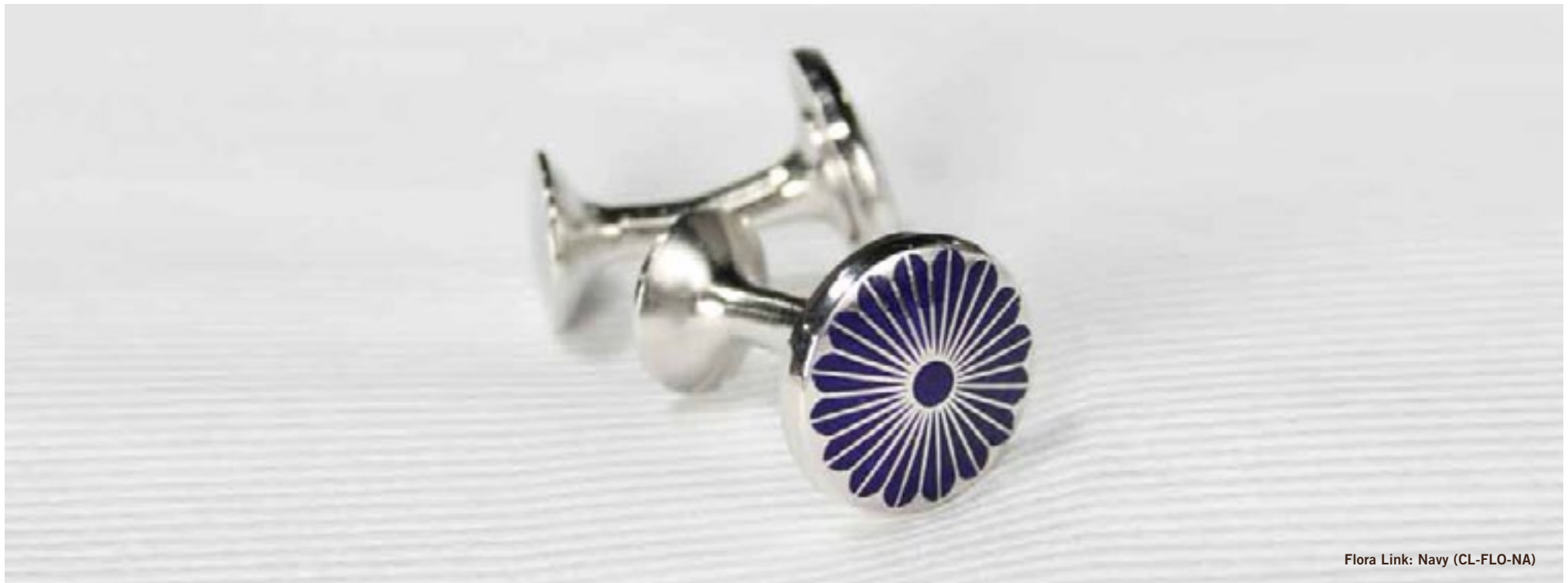
Flora Link: Navy (CL-FLO-NA)