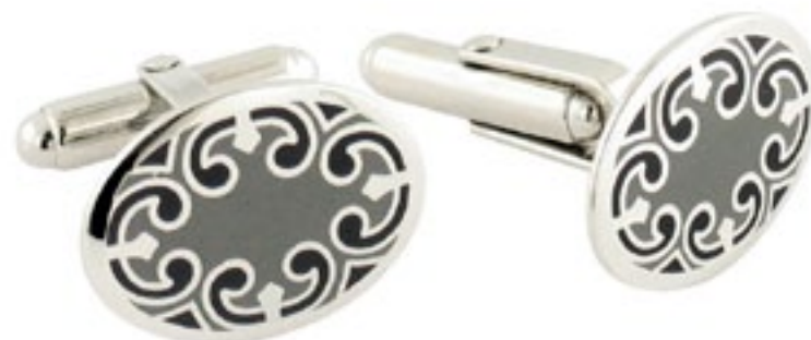
STERLING SILVER OVAL GREY / BLACK (CL-OVAL-GR)