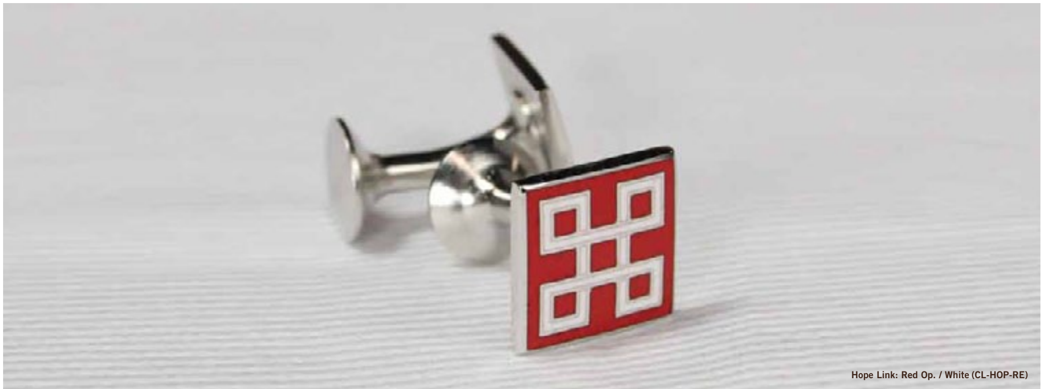
Hope Link: Red Op. / White (CL-HOP-RE)