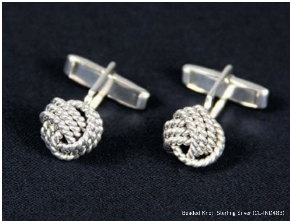
Beaded Knot: Sterling Silver (CL-IND483)