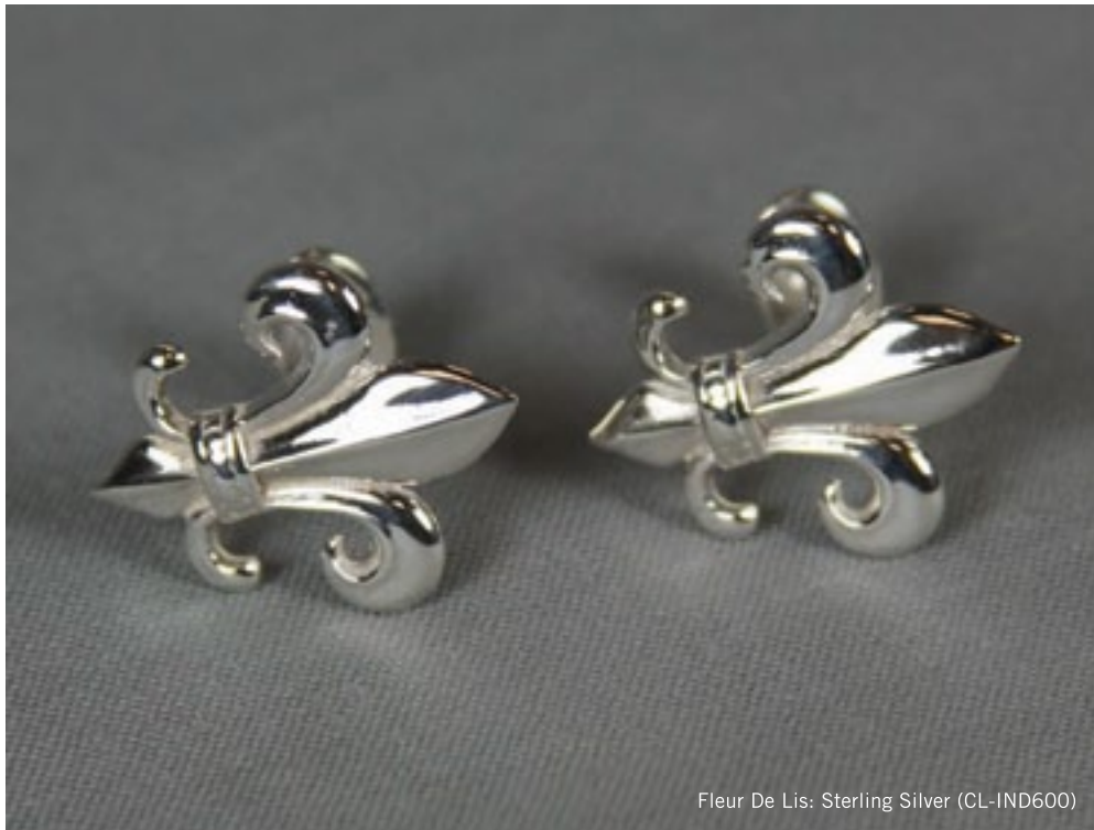
Fleur De Lis: Sterling Silver (CL-IND600)