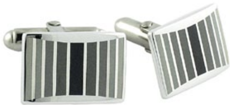
STERLING SILVER BLACK GRADIATED (CL-GRAD-BK)