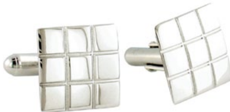
STERLING SILVER SQUARE (CL-SQUA-SS)