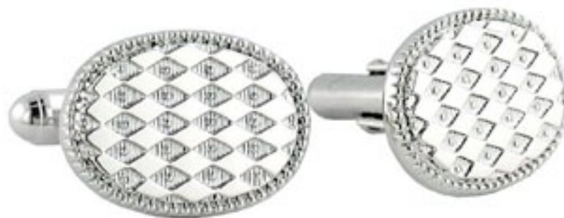
STERLING SILVER OVAL (CL-OVAL-SS)