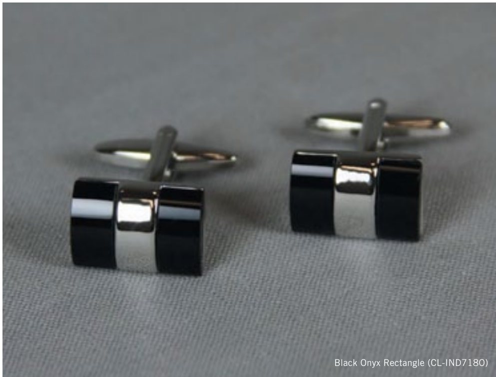
Black Onyx Rectangle (CL-IND7180)