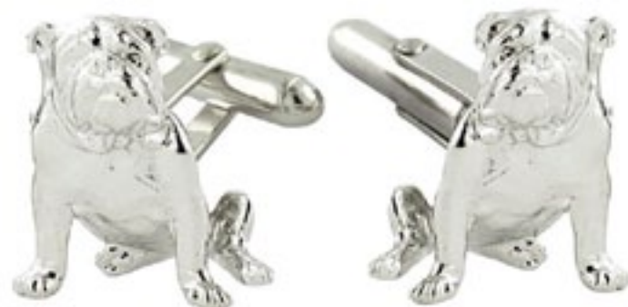
STERLING SILVER BULLDOG (CL-BULL-SS)