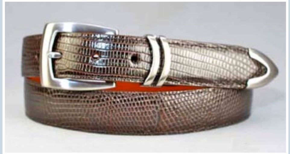
Brown with Silver Tip (BLT-LIZ-BR-SOB)*