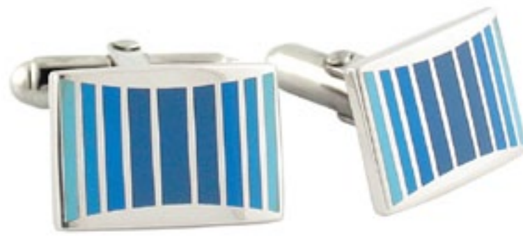
STERLING SILVER BLUE GRADIATED (CL-GRAD-BL)