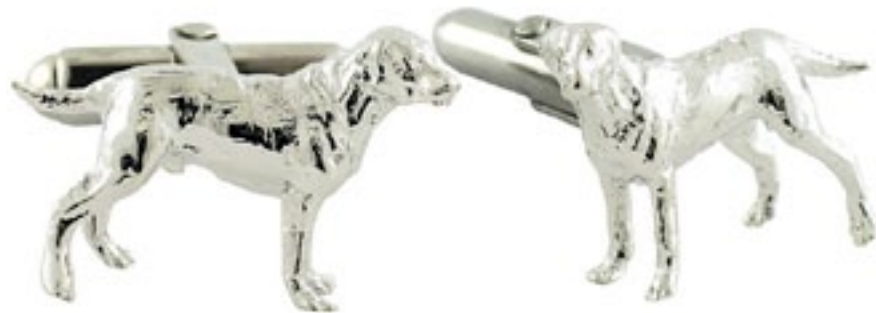
STERLING SILVER LABRADOR (CL-LABR-SS)