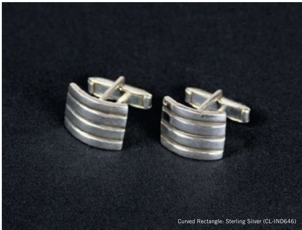
Curved Rectangle: Sterling Silver (CL-IND646)