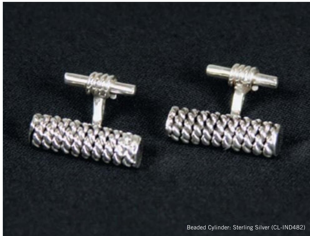
Beaded Cylinder: Sterling Silver (CL-IND482)