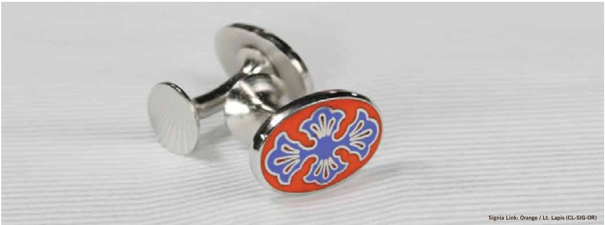
Signia Link: Orange / Lt. Lapis (CL-SIG-OR)