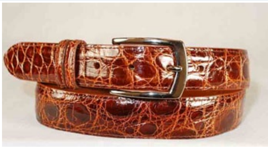
English Tan (BLT-GCR-ET)