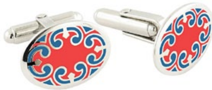
STERLING SILVER OVAL RED / BLUE (CL-OVAL-RE)