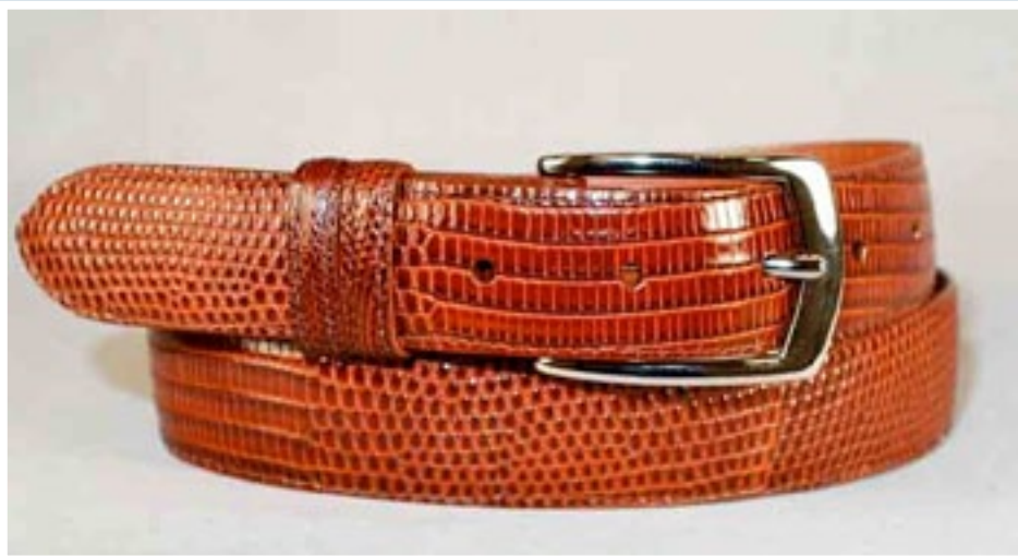
English Tan (BLT-LIZ-ET)