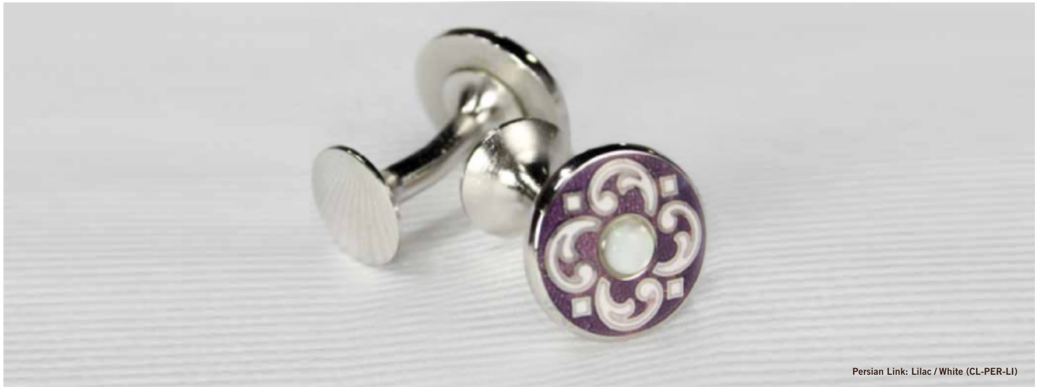
Persian Link: Lilac / White (CL-PER-LI)