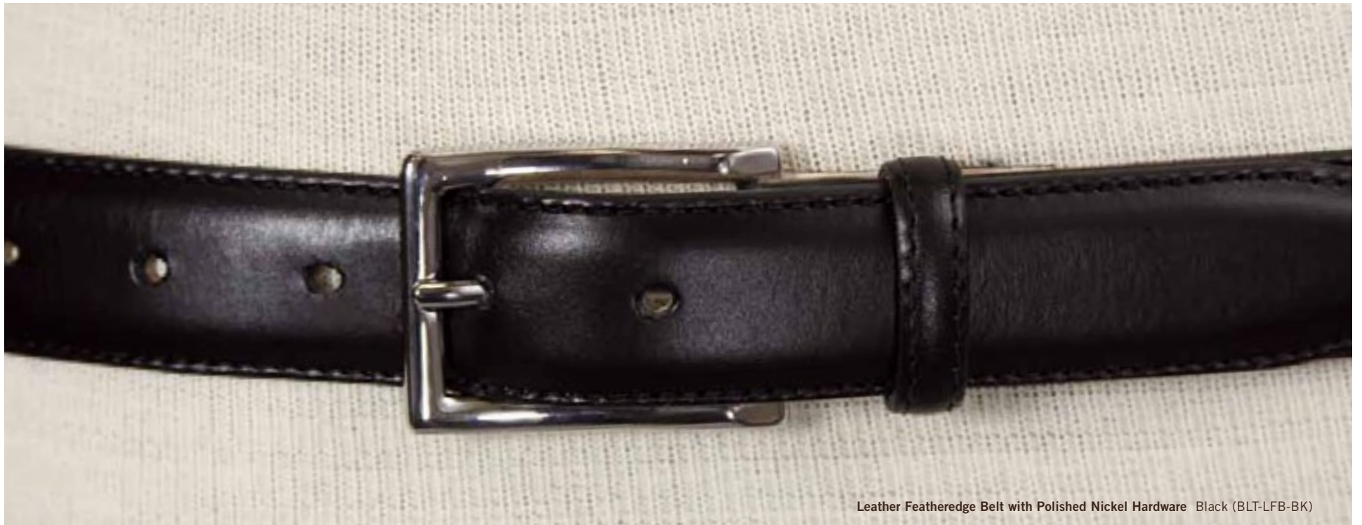
Leather Featheredge Belt with Polished Nickel Hardware Black (BLT-LFB-BK)