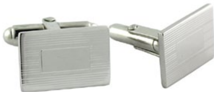
STERLING SILVER ENGRAVABLE (CL-STER-SS)