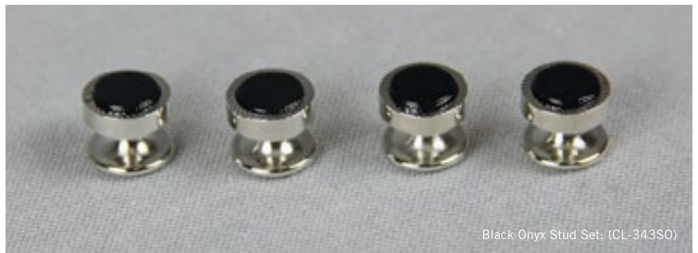
Black Onyx Stud Set: (CL-343SO)