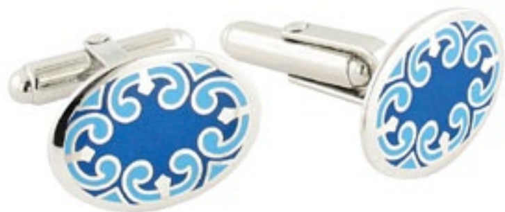
STERLING SILVER OVAL BLUE / LT. BLUE (CL-OVAL-BL)