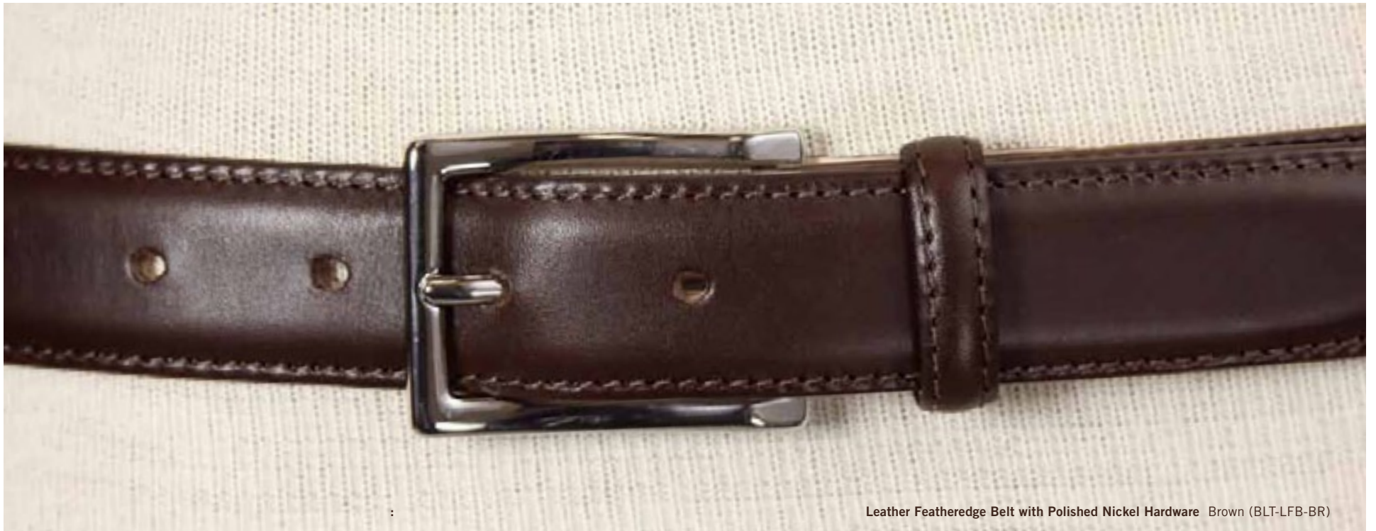
Leather Featheredge Belt with Polished Nickel Hardware Brown (BLT-LFB-BR)