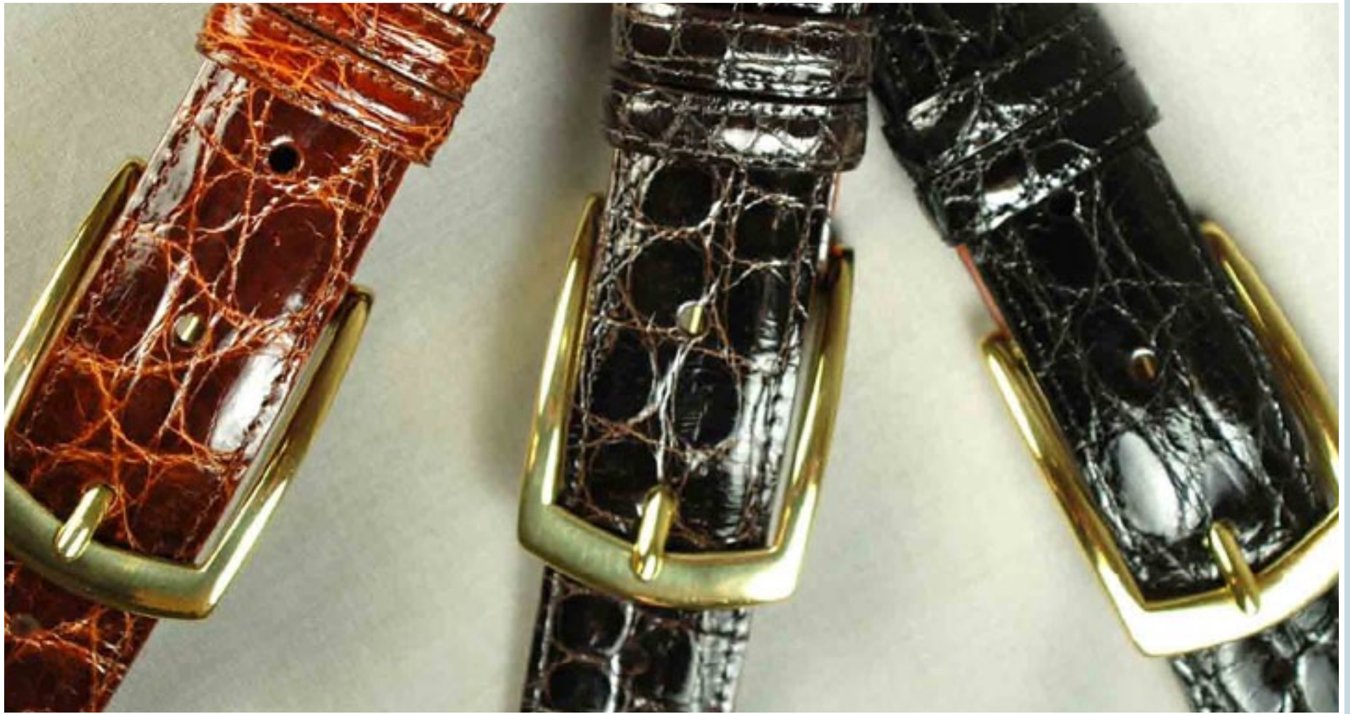
English Tan (BLT-GCR-ET)