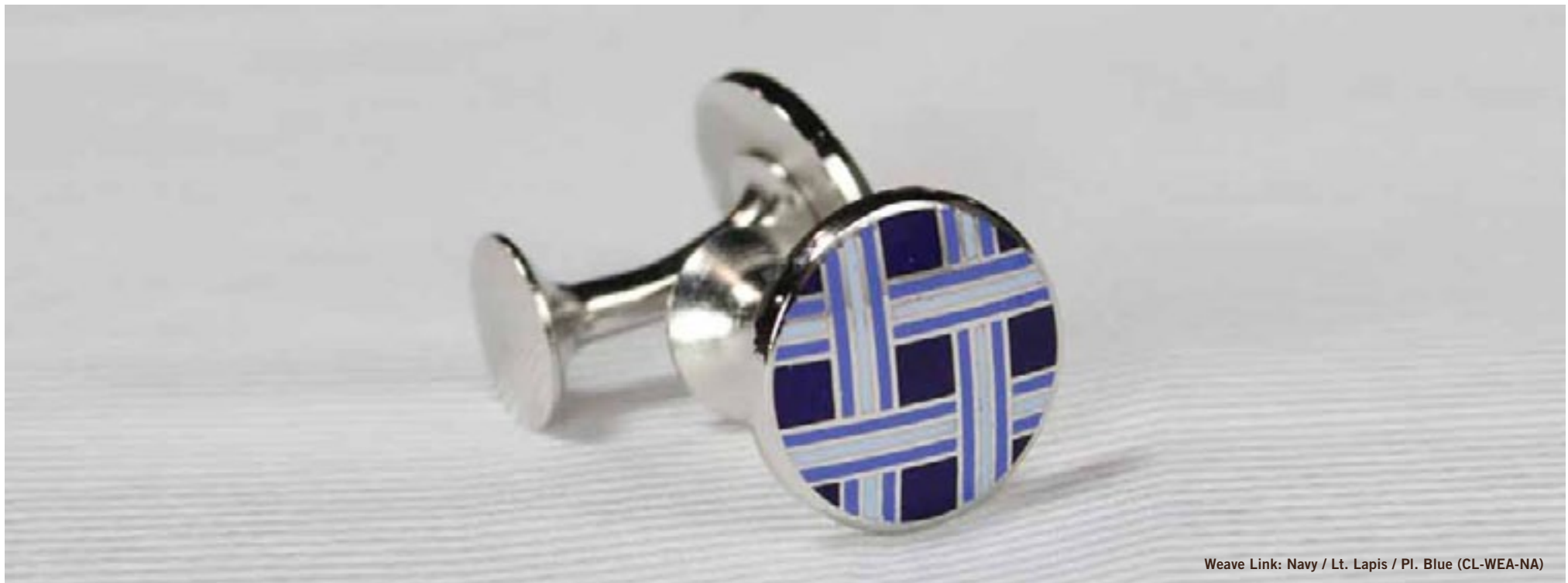
Weave Link: Navy / Lt. Lapis / Pl. Blue (CL-WEA-NA)