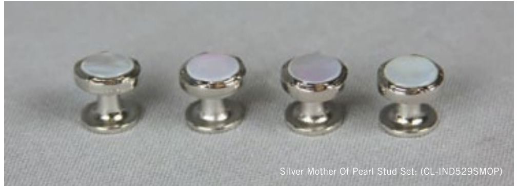
Silver Mother Of Pearl Stud Set: (CL-IND529SMOP)