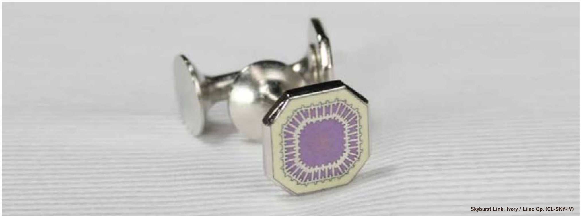
Skyburst Link: Ivory / Lilac Op. (CL-SKY-IV)