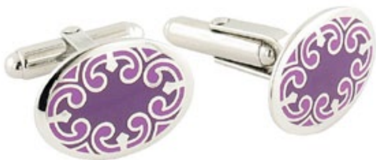
STERLING SILVER OVAL PURPLE / LT. PURPLE (CL-OVAL-PU)