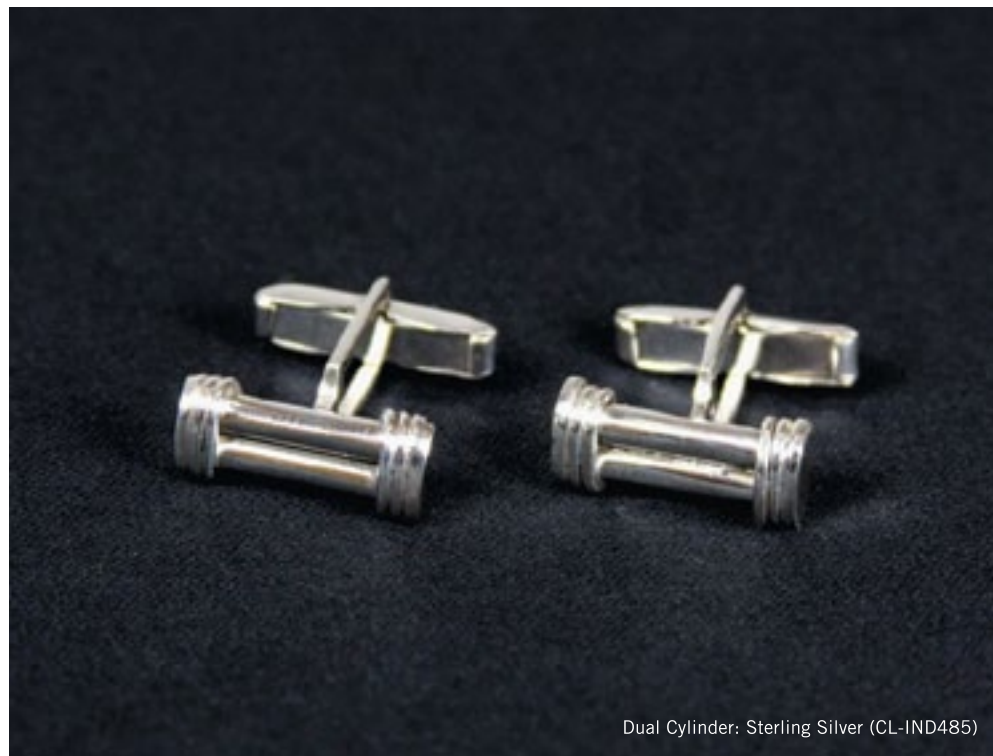
Dual Cylinder: Sterling Silver (CL-IND485)