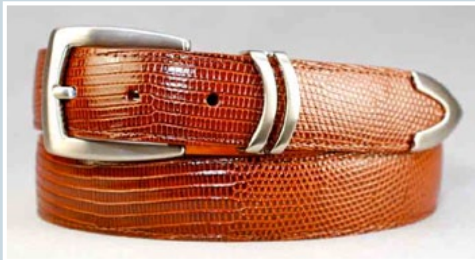
English Tan with Silver Tip (BLT-LIZ-ET-SOB)*