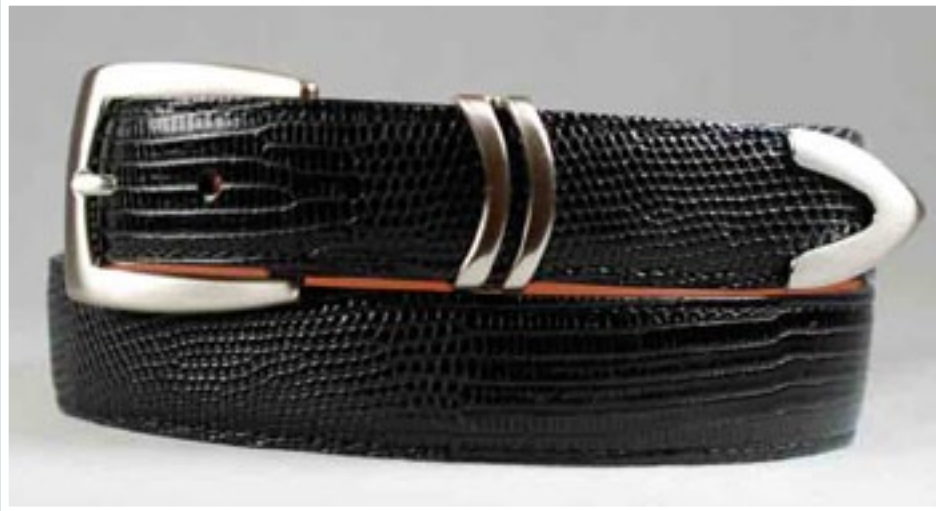
Black with Silver Tip (BLT-LIZ-BL-SOB)*