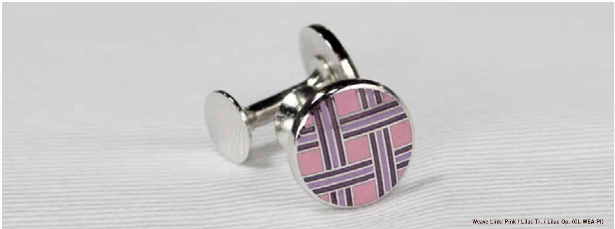
Weave Link: Pink / Lilac Tr. / Lilac Op. (CL-WEA-PI)