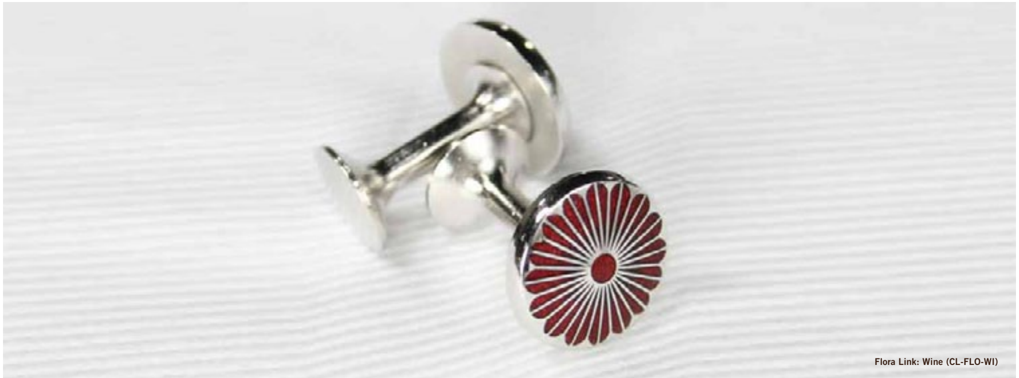
Flora Link: Wine (CL-FLO-WI)