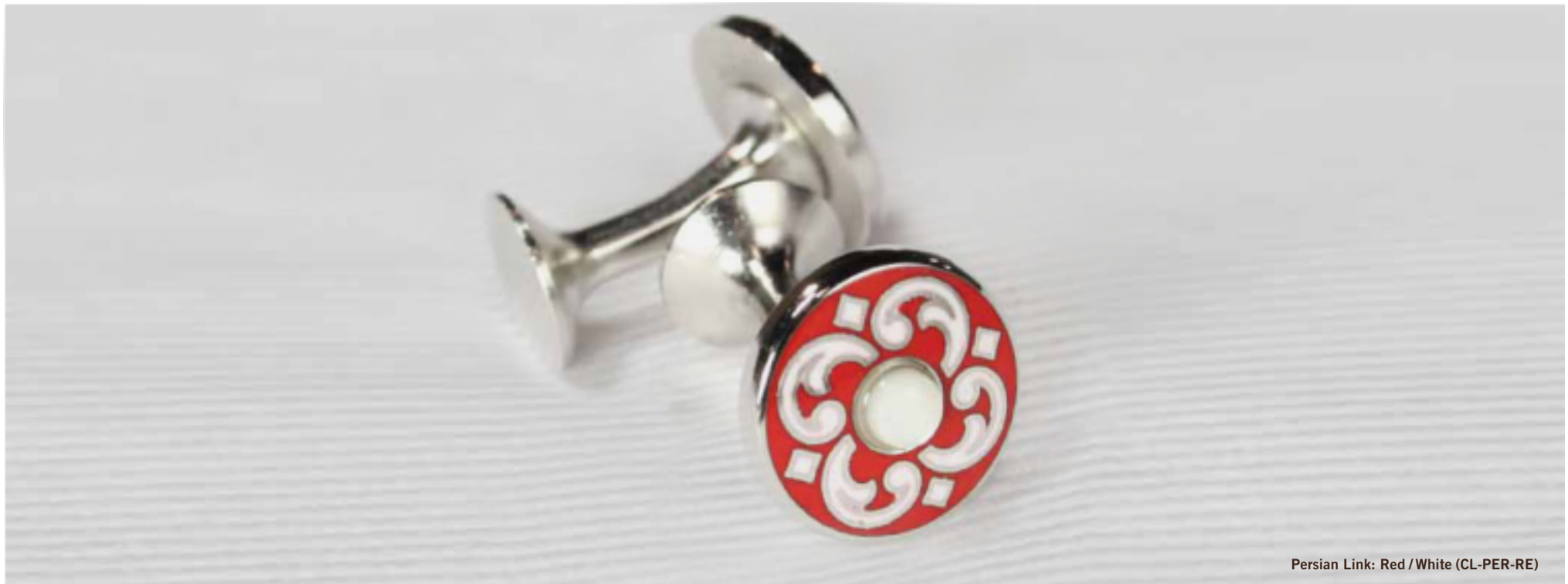
Persian Link: Red / White (CL-PER-RE)