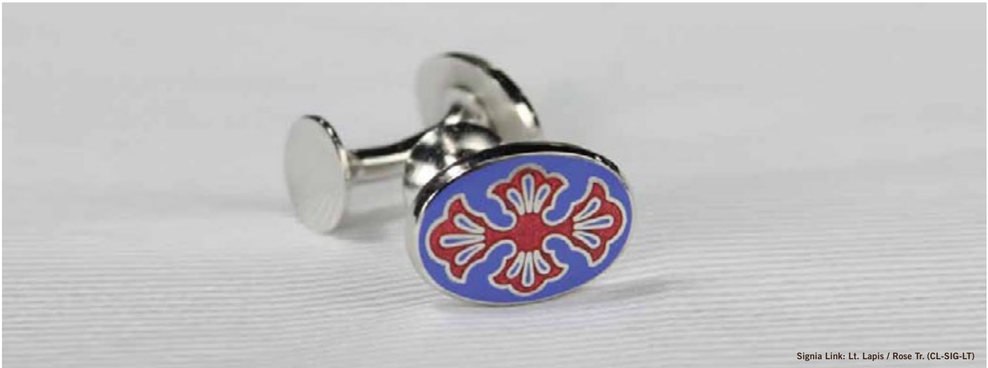
Signia Link: Lt. Lapis / Rose Tr. (CL-SIG-LT)